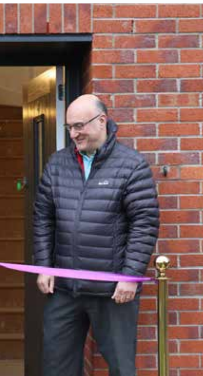
Ribbon cutting at our 1,000th home celebration

Welcome to the latest edition of Gateway News. The days are getting longer, and there's blossom on the trees - it really does feel like Spring is upon us!